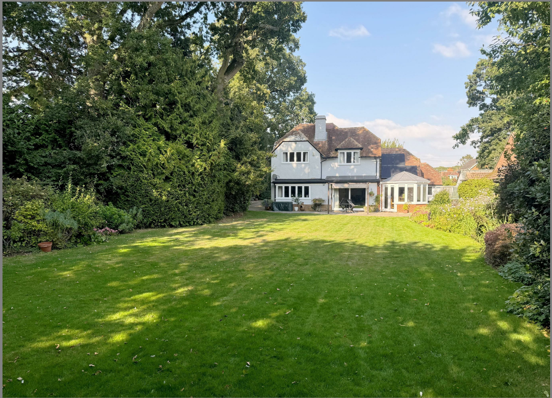
SHOTTACRE , Battery End, Newbury, RG14 6NX